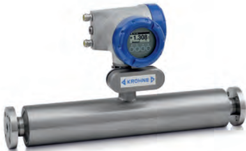
OPTIMASS 7300 C

Direct mass measurement is now possible even with problematic media whose flow could not previously be measured due to unstable measuring tube materials: