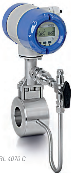
OPTISWIRL 4070 C

The OPTISWIRL 4070 C is KROHNE's answer to the need for an all-purpose device ideal for measuring vapours, gases and liquids in a wide variety of industries. This makes energy consumption transparent: