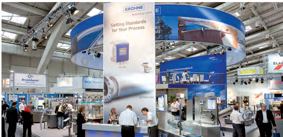
KROHNE at Interkama 2008

Can't make it? Go to www.krohne.de and have a look at the trade fair calendar to find out where we are or contact our sales department. We look forward to seeing you!