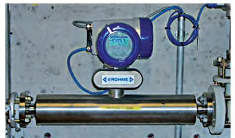
OPTIMASS 7300 C in use

After a few months in test mode, the customer is very satisfied: in addition to the high degree of measuring accuracy, there are no more problems with deposits, the process has been successfully optimised.