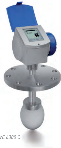
OPTIWAVE 6300 C

The DN80 drop antenna permits measuring ranges of up to 30 metres, thus measuring twice as far as other radar measuring devices in the same price segment. The larger DN150 drop antenna permits measuring ranges of up to 80 metres. Users can choose from several materials and antenna sizes: Depending on the material, application temperatures of up to 200 °C and pressures of up to 40 bar are possible.